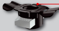
FSM Clix P

The unique and disappearing thrust block on the plastic holder of the sliding nut Clix P guarantees a connection without plastic insert in order for a secure metallic connection .